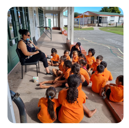
Juniors Outside before their Scavenger Hunt